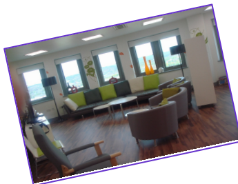
The Leeds Teenage Cancer Trust Units, Ward 78 and Ward 94

After much anticipation in January 2008, the 2nd TCT unit opened in the new Oncology Wing at St James's hospital. This 9 bedded unit was developed to care for our 18-24 year olds. In the same year TCT funded a Nurse Consultant post for the region and a Youth Support Co-ordinator for the new ward. By 2009 a Macmillan TYA CNS was appointed as Team Leader and in 2010 a new TCT Unit for 13-18 year olds was opened at the Leeds General Infirmary to replace the one at St James's when Children's services were moved across the city. In 2010 a TYA MDT Co-ordinator completed the current team.